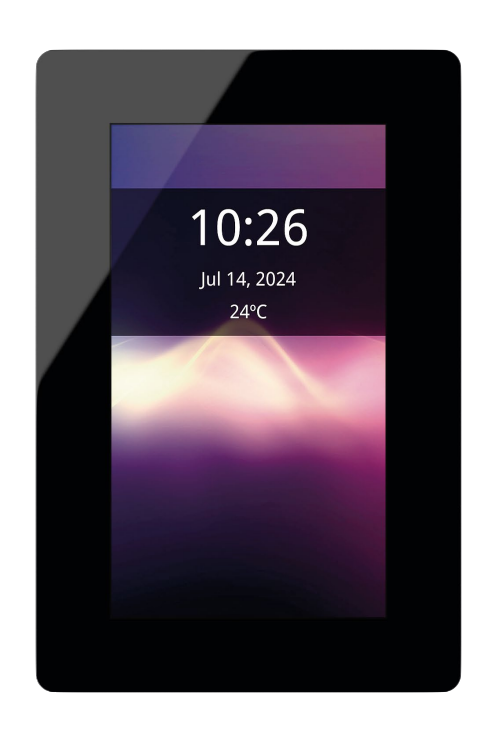
Iddero VERSO 2 4.3" KNX capacitive touch panel