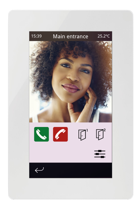
VERSO/INDOOR 4.3" KNX capacitive touch panel with IP connection and door phone function