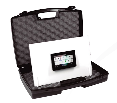
KIT-VERSO2-B / KIT-VERSO2-W Iddero VERSO 2 demo kit