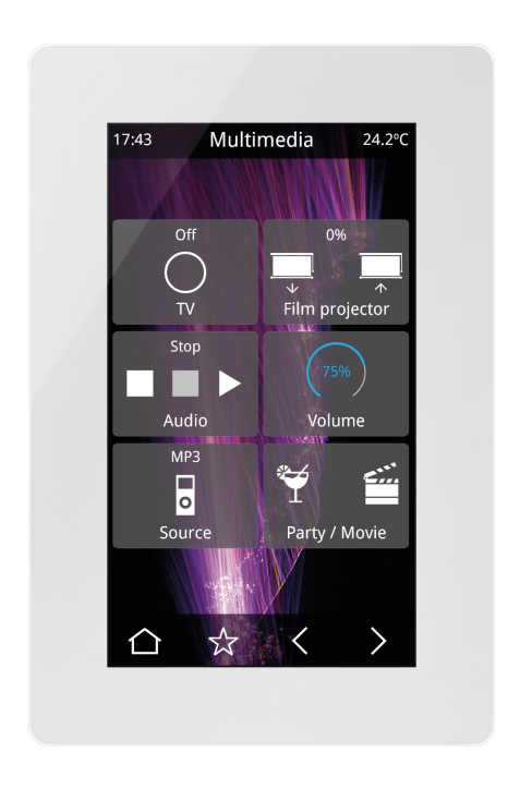
VERSO+IP 2 4.3" KNX capacitive touch panel with IP connection for remote access